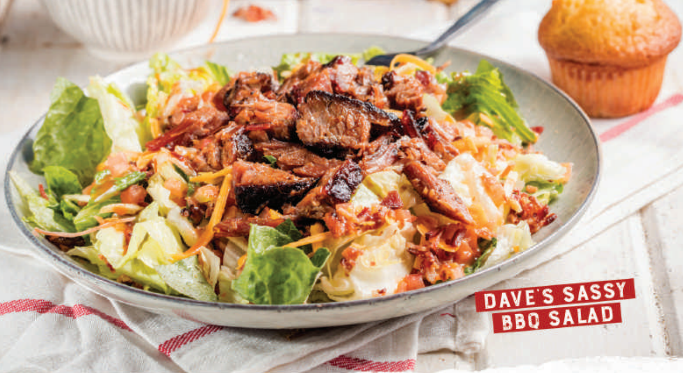
DAVE'S SASSY BBQ SALAD