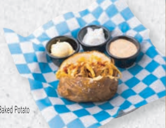
Loaded Baked Potato