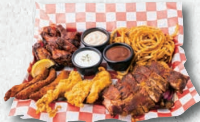
Dave's Sampler Platter

Our Famous Mac & Cheese hand-breaded and tossed in our signature rub, served with our housemade Ranch dressing. (1240 Cal.)