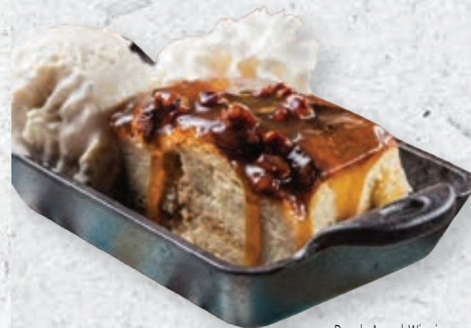
Dave's Award-Winning Bread Pudding

Rich and creamy handmade banana pudding with vanilla wafers. (470 Cal.)