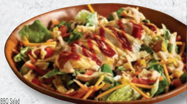
Dave's Sassy BBQ Salad