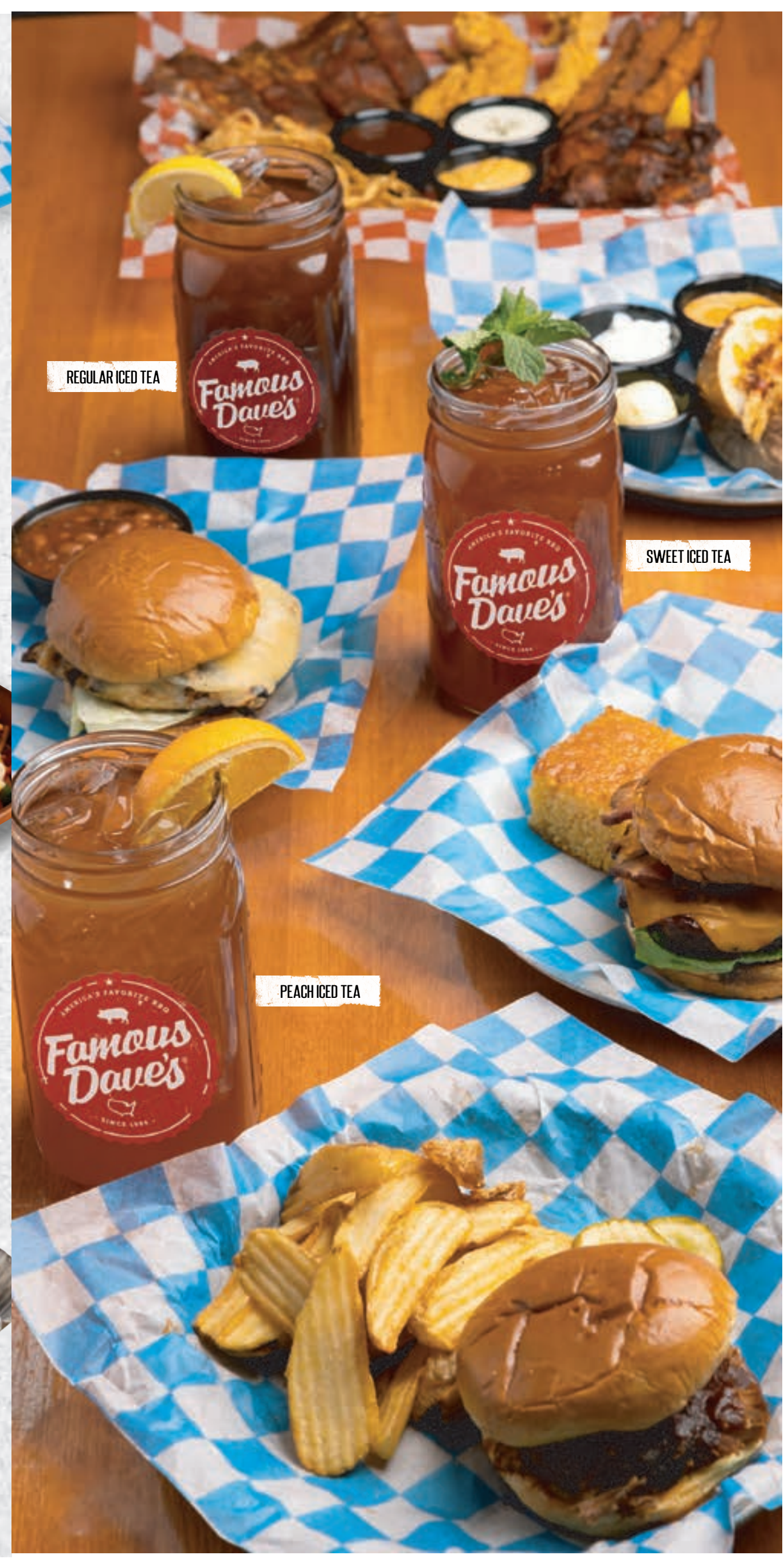
REGULAR ICED TEA