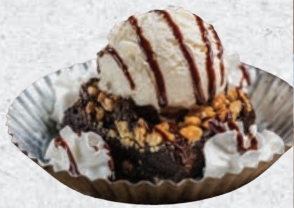
Fudge Mountain Brownie