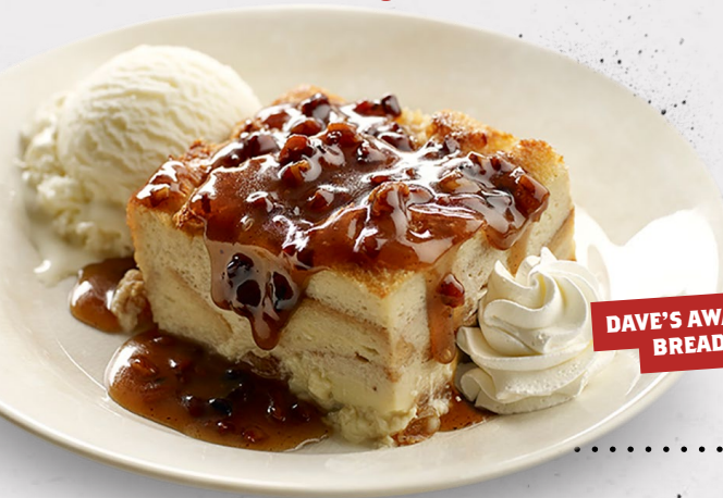
DAVE'S AWARD-WINNING BREAD PUDDING