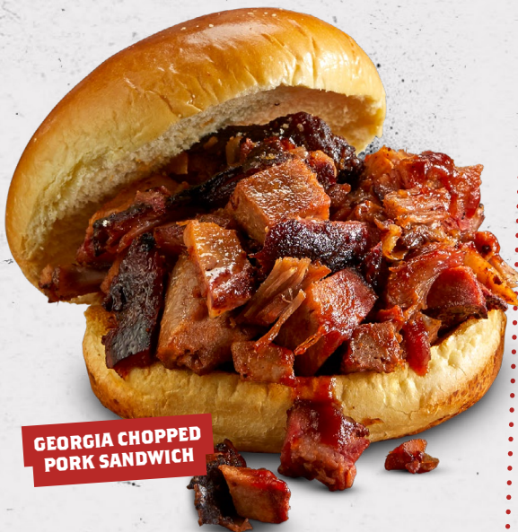
GEORGIA CHOPPED PORK SANDWICH

Grilled chicken with Monterey Jack cheese and bacon. 15