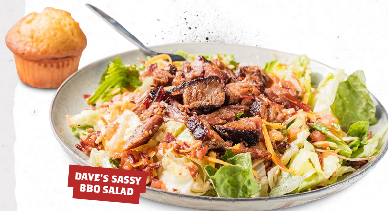
DAVE'S SASSY BBQ SALAD