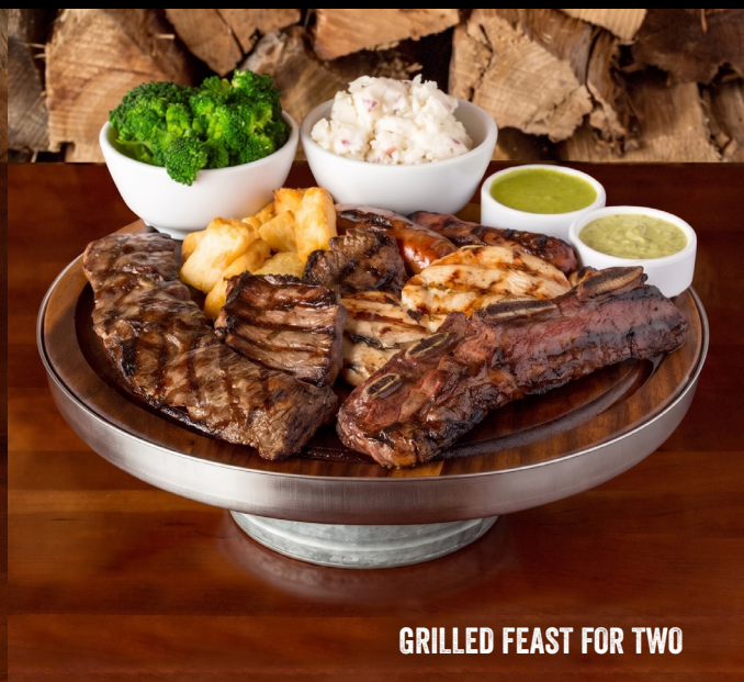
GRILLED FEAST FOR TWO