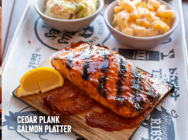
CEDAR PLANK SALMON PLATTER