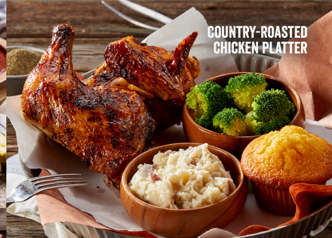
COUNTRY-ROASTED CHICKEN PLATTER