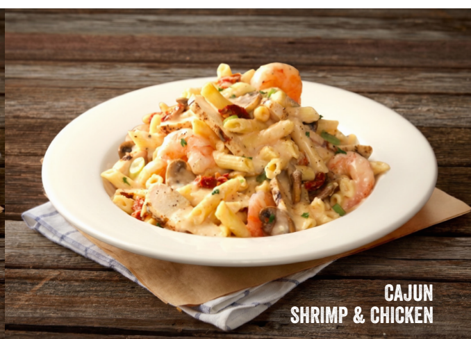
CAJUN SHRIMP & CHICKEN