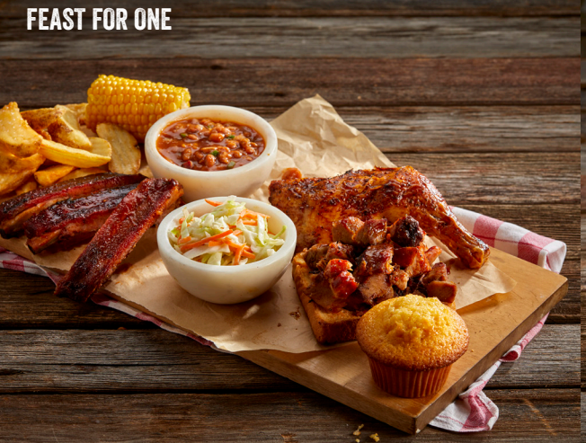
FEAST FOR ONE