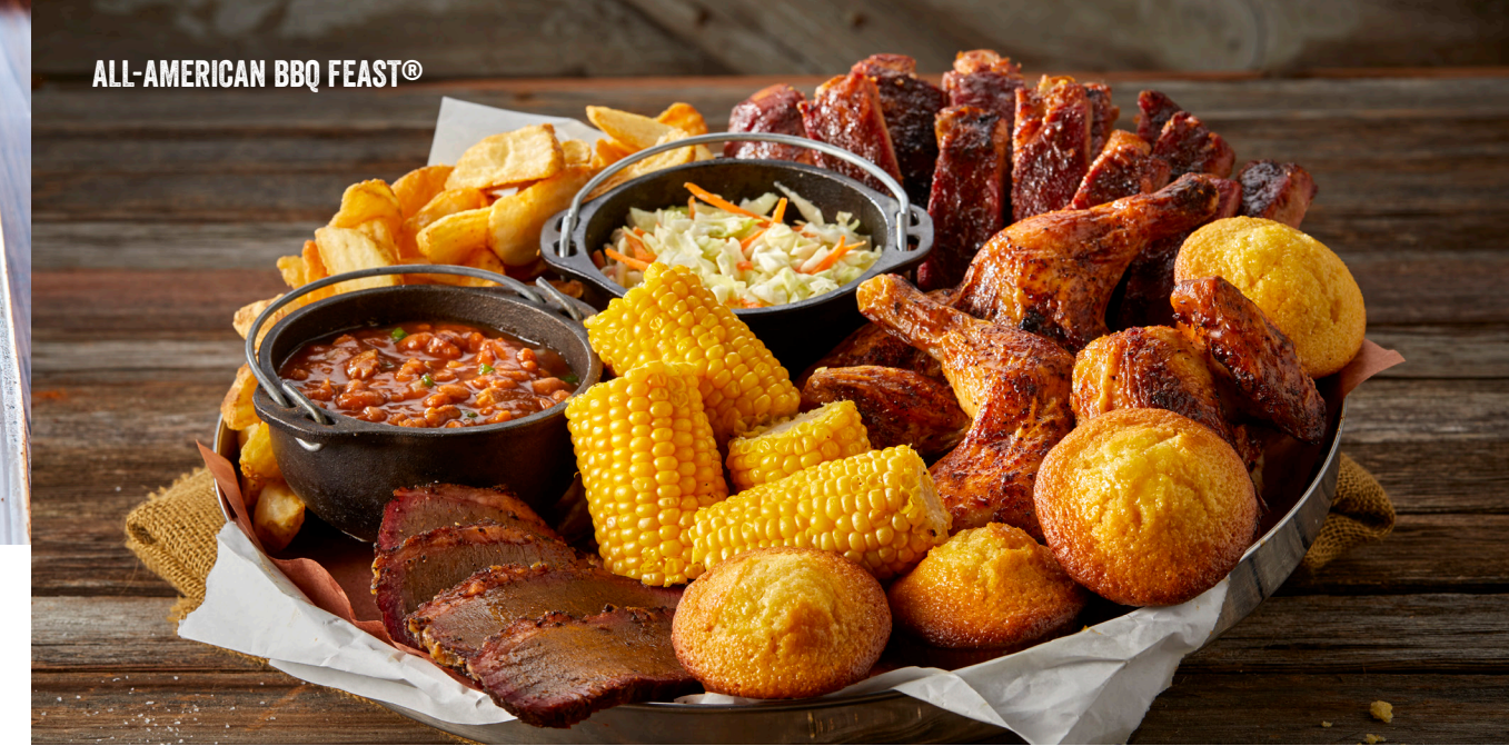
ALL-AMERICAN BBQ FEAST®