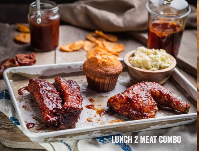
LUNCH 2 MEAT COMBO