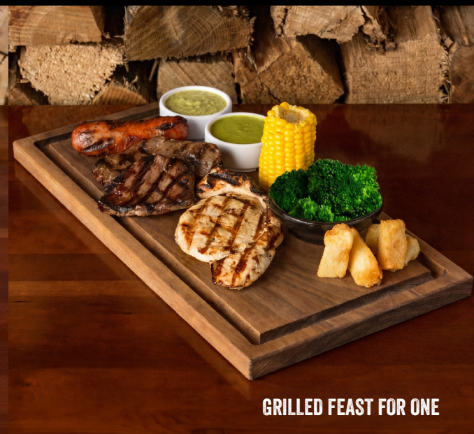
GRILLED FEAST FOR ONE