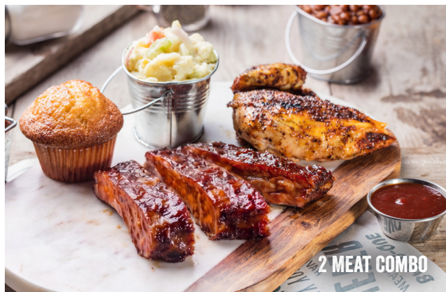
2 MEAT COMBO