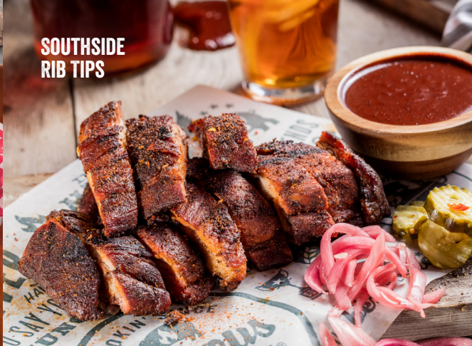
SOUTHSIDE RIB TIPS