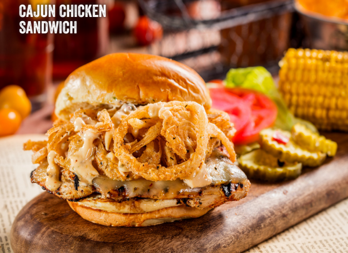
CAJUN CHICKEN SANDWICH