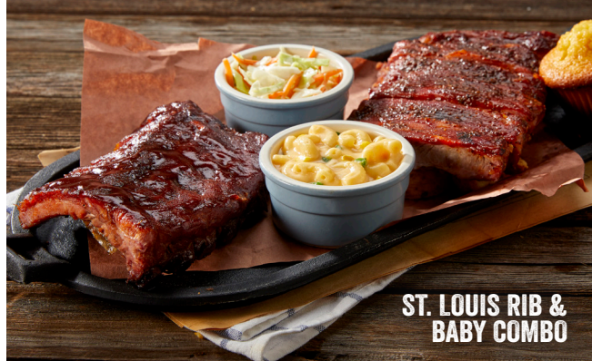
ST. LOUIS RIB & BABY COMBO