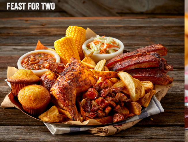
FEAST FOR TWO