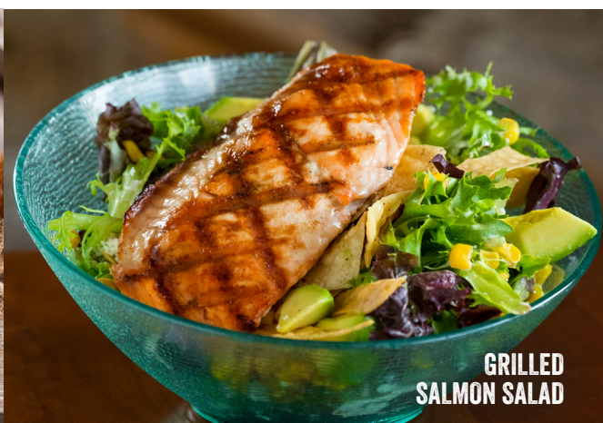
GRILLED SALMON SALAD