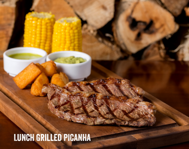
LUNCH GRILLED PICANHA