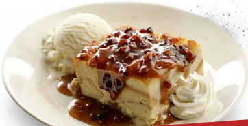
DAVE'S AWARD-WINNING BREAD PUDDING

HOT FUDGE BROWNIE (1190 Cal) 8 1919 ROOT BEER FLOAT (580 Cal) 7.5